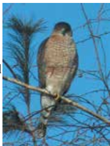
Cooper's Hawk

4. EASTON PONDS. Riparian creeks and ponds accessible by trails, bridges and other amenities. Birds: kingfisher, raptors, osprey, cormorants, Greater Scaup, Bufflehead, Common Merganser. Directions: I-90 exit 71, north to Tree Farm Rd. Follow the road around the bend to where it parallels I-90. Make a left into the parking area. ❖