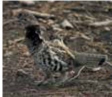
f. Ruffed Grouse

The Kittitas County Birding Trail Map begins just east of Snoqualmie Pass where the Iron Horse State Park/John Wayne Trail (JWT) begins its span of the County from west to east traversing many of the variety of habitats. A few of the best trailheads are mentioned here but others are worth exploring. The JWT is non-motorized and allows hiking, bicycles, horses, skiing and snowshoeing.