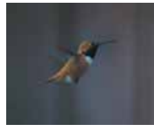
Rufous Hummingbird

11. SALMON LA SAC NORTH. Old-growth forest, riparian corridor and grassy lakes. Birds: Varied Thrush, warblers, Clark's Nutcracker, Gray Jay, raptors, Harlequin Duck, mergansers, chickadee, nuthatch, and swallows. Directions: From Cle Elum go north on SR903 19 miles toward the Salmon la Sac Campground; paved road. Just before crossing the bridge to enter the campground turn right onto the gravel FR4330 (Fish Lake Rd). Follow FR4330 to its end, about 12 miles (rough road) at the Cathedral Pass trailhead. Trail #1345 Cathedral Rock is strenuous and steep. #1376 to Hyas Lake is easy but brushy (mosquitos). Hike the old growth forest and listen for nesting Varied Thrush in summer. Parking at other trailheads and recreation sites. There are concrete creek crossings on FR4330 so take care as warmer days may cause snowmelt to increase water depth at the crossings. ❖ ♠ FP Sr R M C