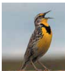
W. Meadowlark

8. COAL MINES TRAIL. Mostly riparian with open Ponderosa Pine transitioning to Douglas fir along a 5 mile, gravel trail from Cle Elum to Ronald with 4 trailheads. Birds: sparrows, finches, (feeder birds), and forest hawks. Directions: a) Cle Elum at West 2 nd and Stafford Avenue. I-90 exit 84 turn north at the South Cle Elum Way stoplight. Travel one block crossing 2 nd Street. ❖ R b) Roslyn at Pennsylvania Avenue. From the Cle Elum trailhead continue north on SR903 (2 nd St) to Roslyn. At Pennsylvania Avenue turn right. The trailhead/parking is on the right in about a block. ❖ c) Roslyn off Washington Avenue. From Pennsylvania Ave turn left. The street dead-ends in the city park parking lot and the trail continues behind the stand of trees past the ballfield. ❖ R d) Ronald behind the Ronald General Store. Continue on SR 903 to Ronald and watch for the General Store on your right. The trail ends here. Kiosk and a couple of parking spots are available. ❖